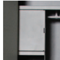
Lockable Box Kit Use this kit and add a lock to store handguns and other valuables.