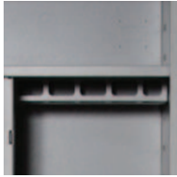
Adjustable Shelf with Integral Garment Hanger Provides clothing separation for better drying.