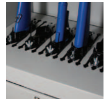
Universal Base Use in conjunction with the EZ Rail or support rail, and with Spacesaver weapons storage components.