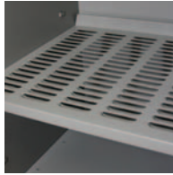
Louvered Shelf For ventilation and drying – great for body armor.