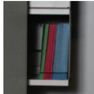
Modular Shelf Available in 12" and 24" heights. Add accessories like the file divider kit to further compartmentalize and customize the locker.