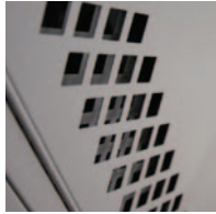
Visibility/Circulation Diamond perforated doors offer visibility as well as natural air circulation and ventilation.