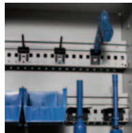
EZ Rail™ Element Innovative engineering offers flexible storage of hanging bins, slat wall accessories and weapons storage components.