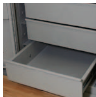
Internal Drawers 6 and 9 inch high drawers offer more custom space, and are available in locking or non-locking configurations.