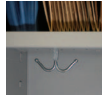
Hook Kits Add single hooks to the side of the modular shelf or a double-hook to the bottom for more hanging storage.