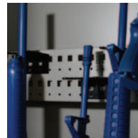
Support Rail Use with Spacesaver weapons storage components or other specialty storage accessories.