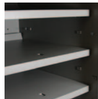
Adjustable Shelf Available in standard and heavy duty capacities for storing everything from clothing to ammunition.