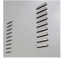
Louvered Doors and Drawers Louvers help direct optimal air circulation.