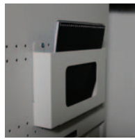
Document Holder Door-mounting allows easy access to documents and notebooks.