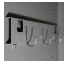
3-Hook Bracket Hook bracket can be moved up and down, and from one side of the locker to another.