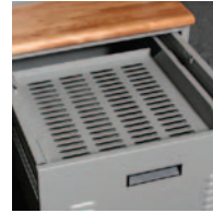
Ventilation Rack Sliding rack that sits in bench drawer for ventilation.